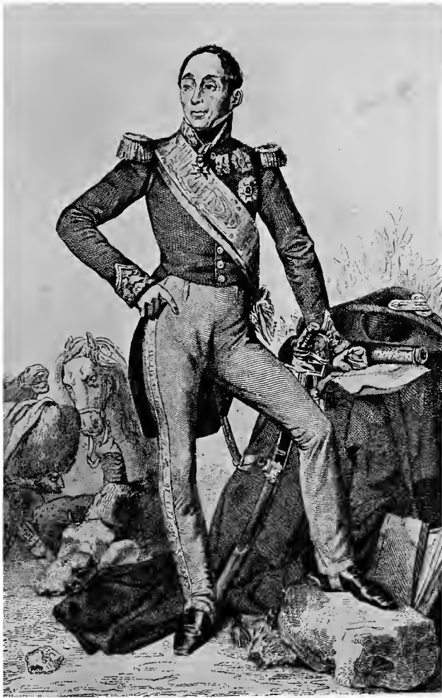
EMMANUEL DE GROUCHY, MARQUIS FROM AN ENGRAVING AFTER THE PAINTING BY ROUILLARD